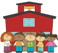
Photo retakes will be done on Friday, November 3rd, for any students needing to retake their school picture.

‘Knowing Jesus, Growing in Faith, Serving with Love’