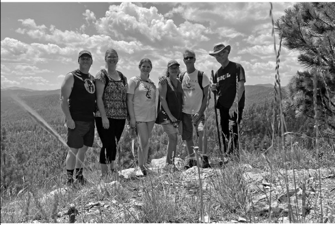
Buzzard's Roost July 9. Next up—a gentle, mostly level hike at Willow Creek Trail.

All ages and skill levels welcome. Meet in the narthex following the 10:00 service: