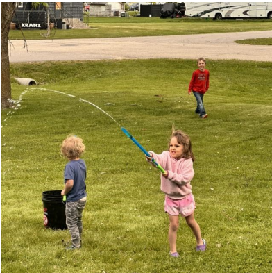
My kids playing in Grandpa’s yard.

My favorite place is my hometown of Kranzburg, SD. It is a tiny little town east of Watertown made up of about 160 people. My grandpa grew up there and he raised his kids there and my dad raised us there. It is such a quiet little place where kids can just be kids and run around town together playing “night games” in the summer or building tunnels in giant snow piles in the winter. You don’t have to worry so much about strangers because half the town is related.