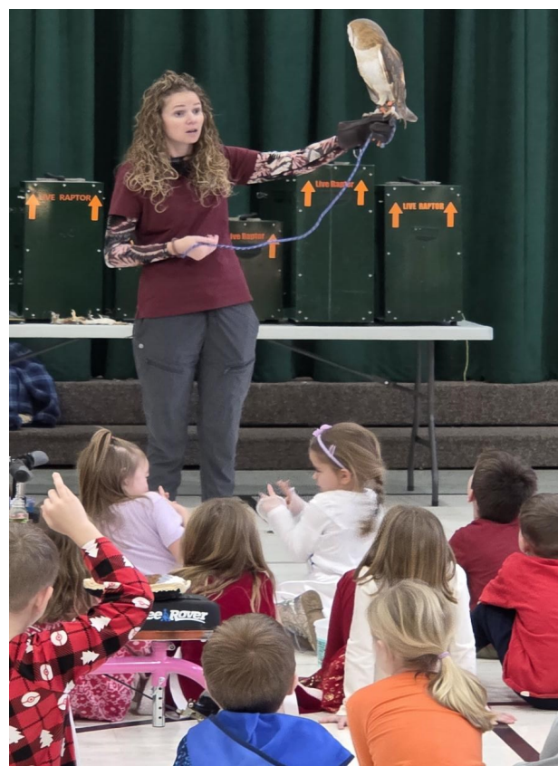
Black Hills Raptors presenting one of their birds of prey to Zion students during Lutheran Schools' Week.