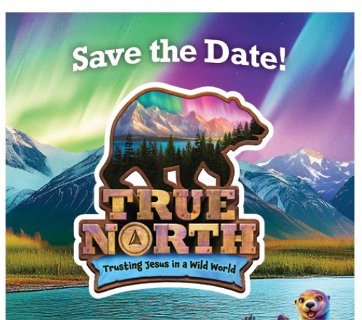
VBS June 2-6, 2025. Registration coming soon!

May 28: Youth Group meets at 6pm at Zion.