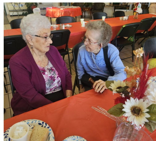
OWLS visiting after the luncheon.